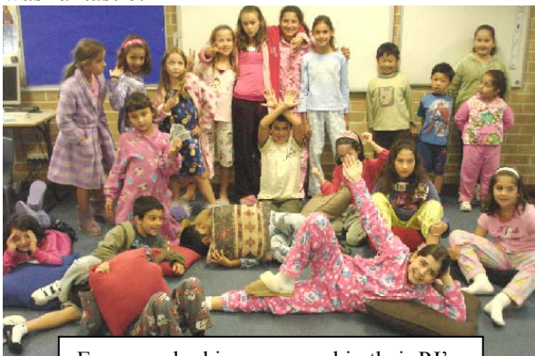
Everyone looking very cool in their PJ's

On Tuesday vacation care was taken to Fox Studios to enjoy 'Nim's Island' with popcorn and drinks. On Friday it was pyjama and pizza day. We all came in with our pyjamas and played heaps of games. My day was fantastic!